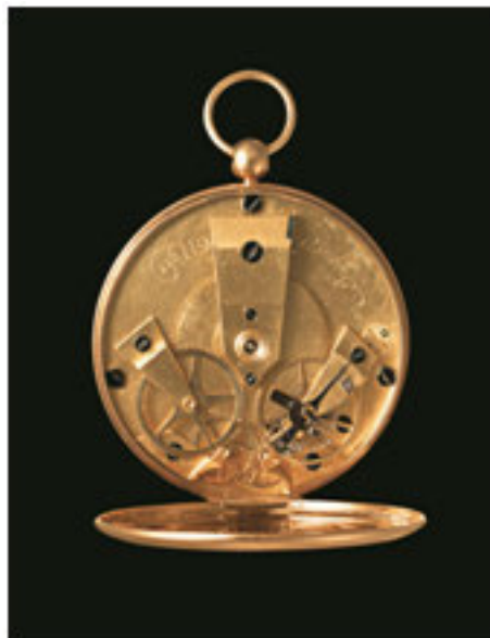
Typical movement of a "Souscription" watch. Calibre with centre going barrel, overhanging ruby cylinder escapement, pare-chute suspension and bimetallic thermal compensation curve on the index. Diameter: 57 mm. Sold in 1803 to Mr. Frankman, for the sum of 692 Francs.

Four timepieces by company founder go on display in Getty's world-renown permanent collection of French Decorative Arts through October